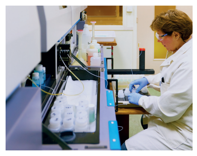
Corrosion rates of solution annealed stainless steels in nitric acid solutions

UR<sup>M</sup> 65 has approximately the same pitting corrosion resistance as 316L.