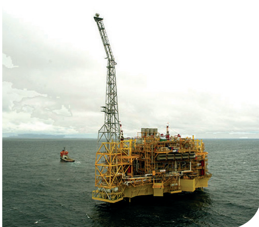
TPG 500 for Total Fina Elf (Elgin Field)