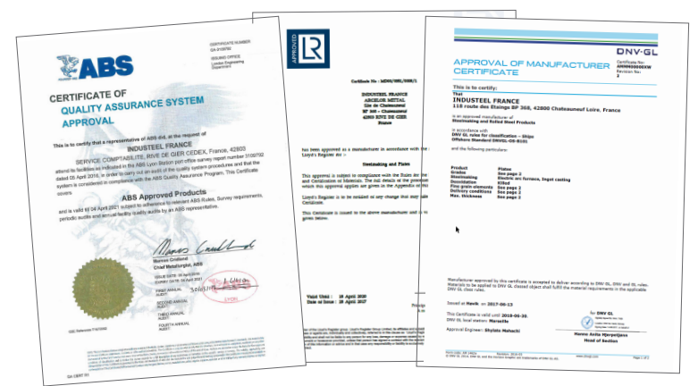
The 3 Industeel mills are approved by Lloyd's, American Bureau of Shipping (ABS), DNV-GL (Det Norske Veritas) and Bureau Veritas for the manufacturing of steel grades fitting to offshore requirements.