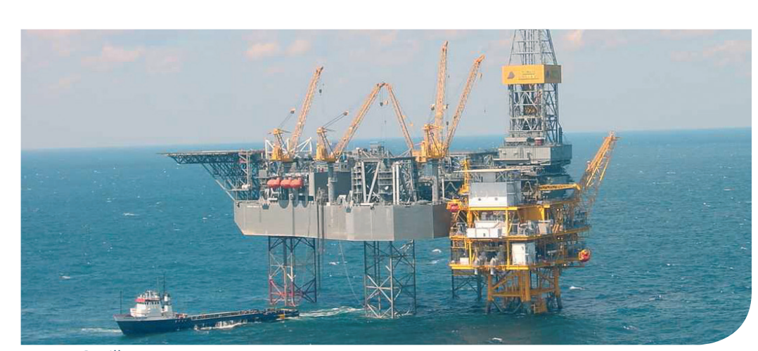
Rowan Gorilla VI : Letourneau